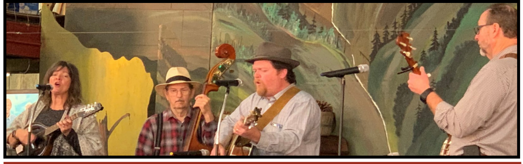
The New York Times has hailed the Museum of Appalachia as a "discovery of a way of life" and the official Tennessee Blue book recognizes the Museum as the "most authentic and complete replica of pioneer Appalachian life in the world."

After your self-guided tour, sit down to a full Southern Appalachian country buffet in our comfortable banquet hall and enjoy authentic traditional and bluegrass music from our own Museum of Appalachia Band. After the meal, browse our museum gift shop for American-made crafts and gifts, many from local and regional artisans, or relax in a high-backed rocking chair on our covered porch overlooking the scenic museum grounds.